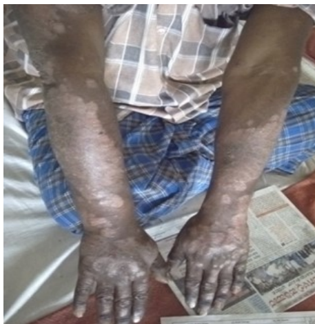
Fig 1: Before treatment