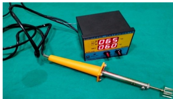
Image 1: Modified Agnikarma Device (Temperature controlling unit with probe)

This probe has been designed to minimize the pain by applying it on skin for once for mere 10 seconds, utmost tender(painful)part, thus, making the procedure user friendly, safe (without iatrogenic effects) and making procedure swift.