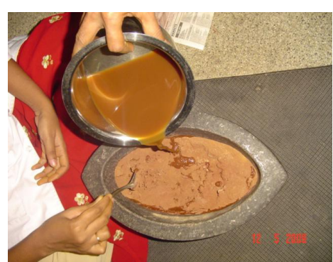
Figure 3: Mixing of the ingredients