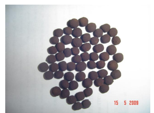
Figure 4: Dhatrilouha pills