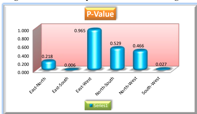
Fig 2 - Pairwise Comparison between the Regions