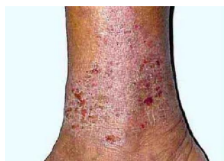
Figure 1: Before Treatment Figure 2: After treatment